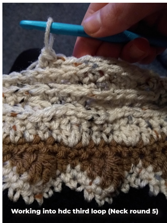
Working into hdc third loop (Neck round 5)