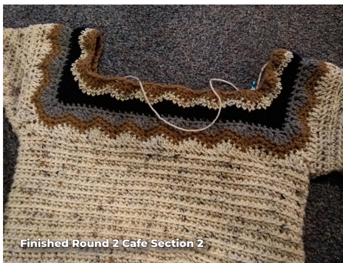
Finished Round 2 Cafe Section 2

Front: 27 (or half your multiple of 12 minus 4, plus 2) sc (27 st)